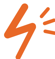
Einar ® antistatic agents